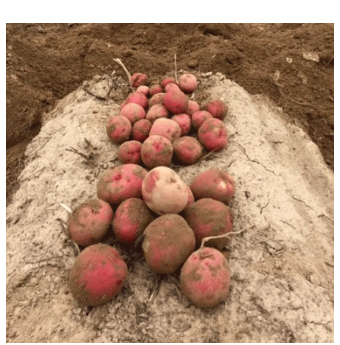
Lower Yield & Grades