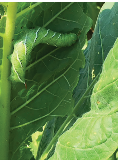
Top: Tobacco Hornworm. Inset: Stargus University Trial assessing target spot & foliar disease control.